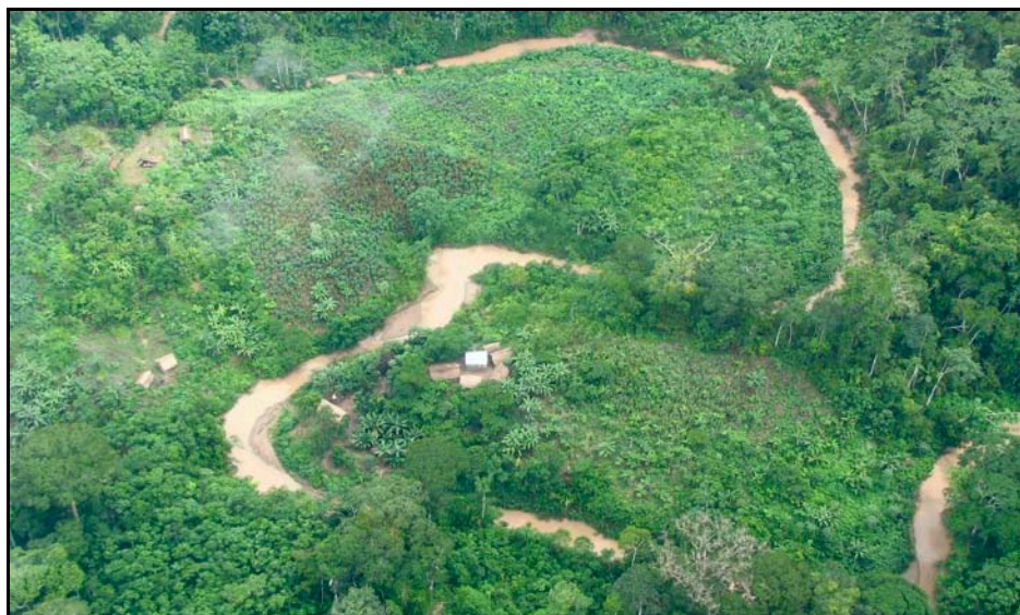
Photo A: Logging settlement in the headwaters of the Mapuya River near the border of the Alto Purús National Park inside the Murunahua Reserve

A large logging operation is based in the headwaters of the Mapuya River near the border of the Alto Purús National Park (see Photo A). Originally discovered by UAC in March 2009, an April overflight observed two large rafts of recently cut mahogany boards, indicating the settlement continues to be used as a transport center for mahogany illegally removed from the Reserve and Park.