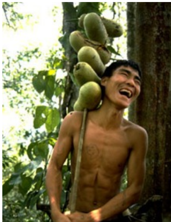
A Penan man collects jackfruit from the forest.

Enthusiasm for large dams is resurfacing, driven by the international dam lobby which is working hard to paint its industry as a panacea to climate change. The lessons learned last century are being ignored, and tribal peoples worldwide are again being sidelined, their rights violated, and their lands destroyed.