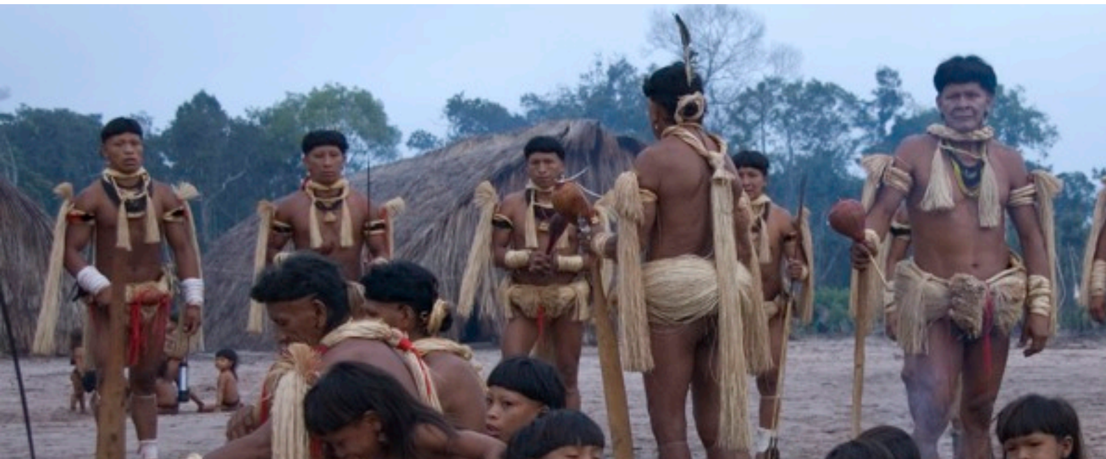
Enawene Nawe performing their annual yākwa ritual, which is linked to the fish they catch in the tributaries of the Juruena River

waves of violence against the Jummas. Most of those who were evicted for the Kaptai dam are still living in India, unrecognized by either state. Those who have remained in or returned to their territories are further threatened by a proposed second Kaptai dam, for which Bangladesh has reportedly approached the USA regarding assistance. 28 No attempt has been made to inform or consult the Jumma people about these plans.