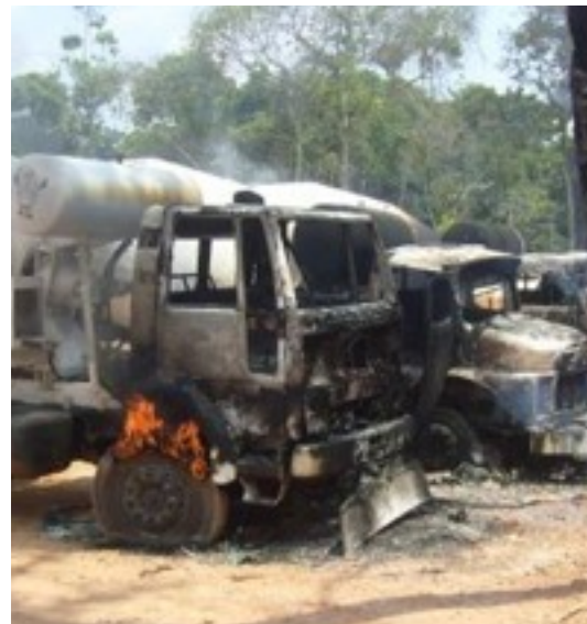
The Enawene Nawe invaded the construction site of the Telegráfica dam in 2008, destroying it.

The Protocol does not set any minimum standards for dam construction. Instead, various aspects of proposed projects are given a score between one and five. Thus a poor score for 'quality of the management planning process with respect to indigenous peoples issues, risks and opportunities' might be offset by a good score on 'transparency and competitiveness of the bidding process in awarding of contracts.' 12