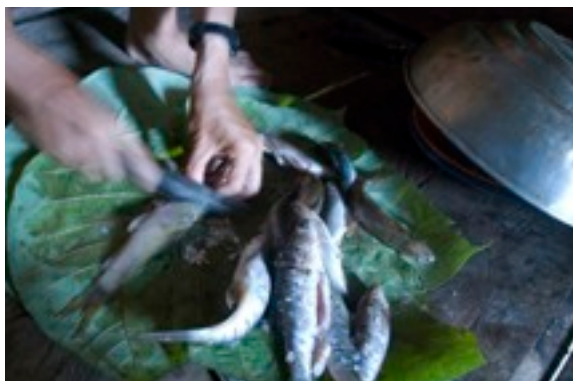
Fish are an important food source for Penan

Consultation may also begin well into the dam project's lifecycle, after considerable finances have already been committed to the dam. Construction of the Gibe III dam was already underway when the most affected tribes first became aware of the project (see Omo Valley tribes box), and the Penan were simply told they would have to move for the Murum dam (see Penan box).