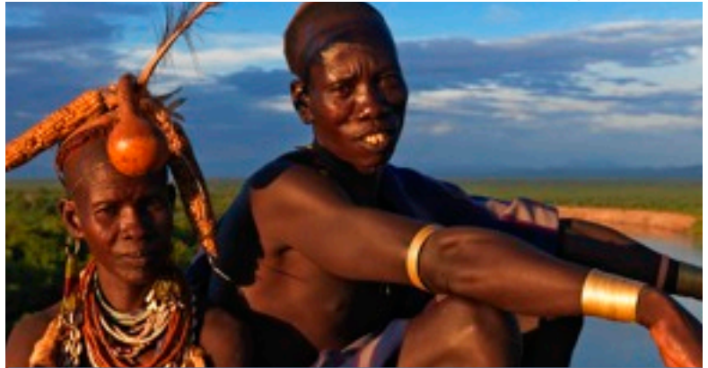
Omo Valley tribes Ethiopia

A Karo man and woman sit in front of Ethiopia's Omo River, which is a lifeline in their parched land