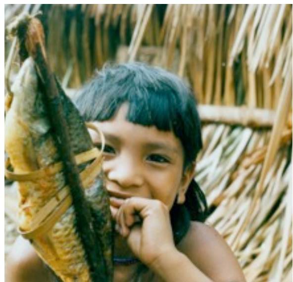
An Enawene Nawe child holds aloft a fish that has been smoked on the river bank.

recognized the damage the dams caused, and an ambitious decommissioning process is