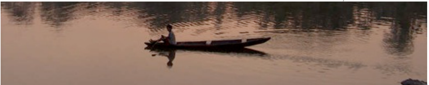
Pirahã man in a canoe. The Pirahã will be affected by the Madeira River dams

Where tribes do receive compensation it is frequently arbitrary and administered by outsiders. As many indigenous leaders have emphasized, no amount of compensation can make up for loss of land.